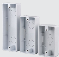
PVC SWITCH BOX