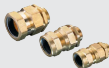
COPPER CABLE GLANDS