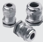
GI CABLE GLANDS