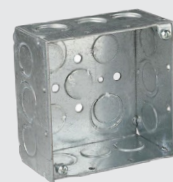
STEEL SWITCH BOX