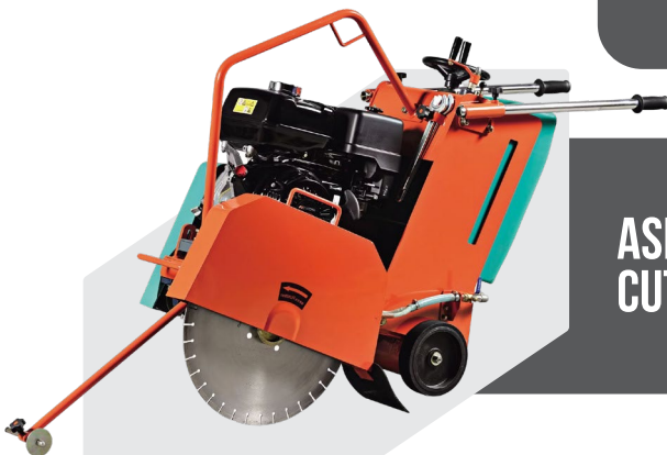
ASPHALT/CONCRETE CUTTING MACHINE