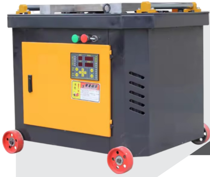
REBAR CUTTING & BENDING MACHINE