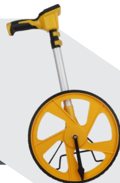
DIGITAL MEASURING WHEEL